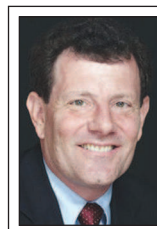
NICHOLAS KRISTOF Comment

There's still plenty we don't know and lots of uncertainty about the future. But