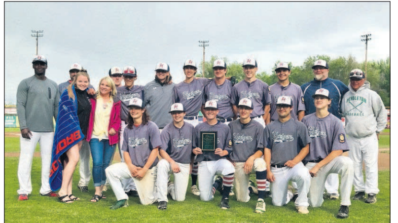
Hodgen Distributing poses with championship plaque after its 3-2 victory over Redmond to win the Ashlee Hodgen Memorial Tournament on Sunday at Bob White Field in Pendleton.