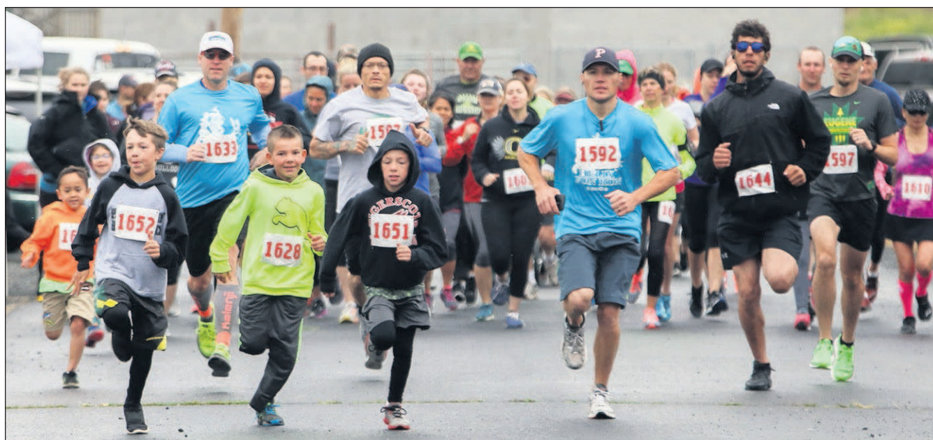
Runners take off at the start of the Heart of the Country fun run Saturday in Helix as part of Helix Community Day.

The CTUIR has not yet identified the driver or cyclist.