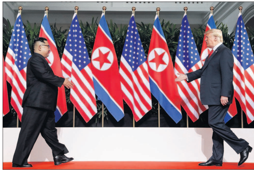
U. S. President Donald Trump and North Korea leader Kim Jong Un walks toward each other at the Capella resort on Sentosa Island Tuesday in Singapore.

Aware that the eyes of the world were on a moment that many people never expected to ever see, Kim remarked that many of those watching "will think of this as a scene from a fantasy ... science fic-