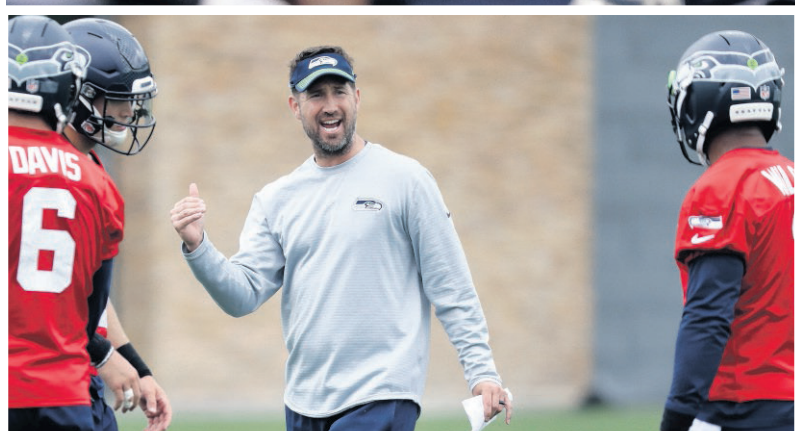
Seattle Seahawks defensive coordinator Ken Norton Jr. (above) directs players as offensive coordinator Brian Schottenheimer (left) directs quarterbacks during an NFL football practice Thursday.

chance to work with a quarterback he watched from the other sideline during his three years working with the Rams.