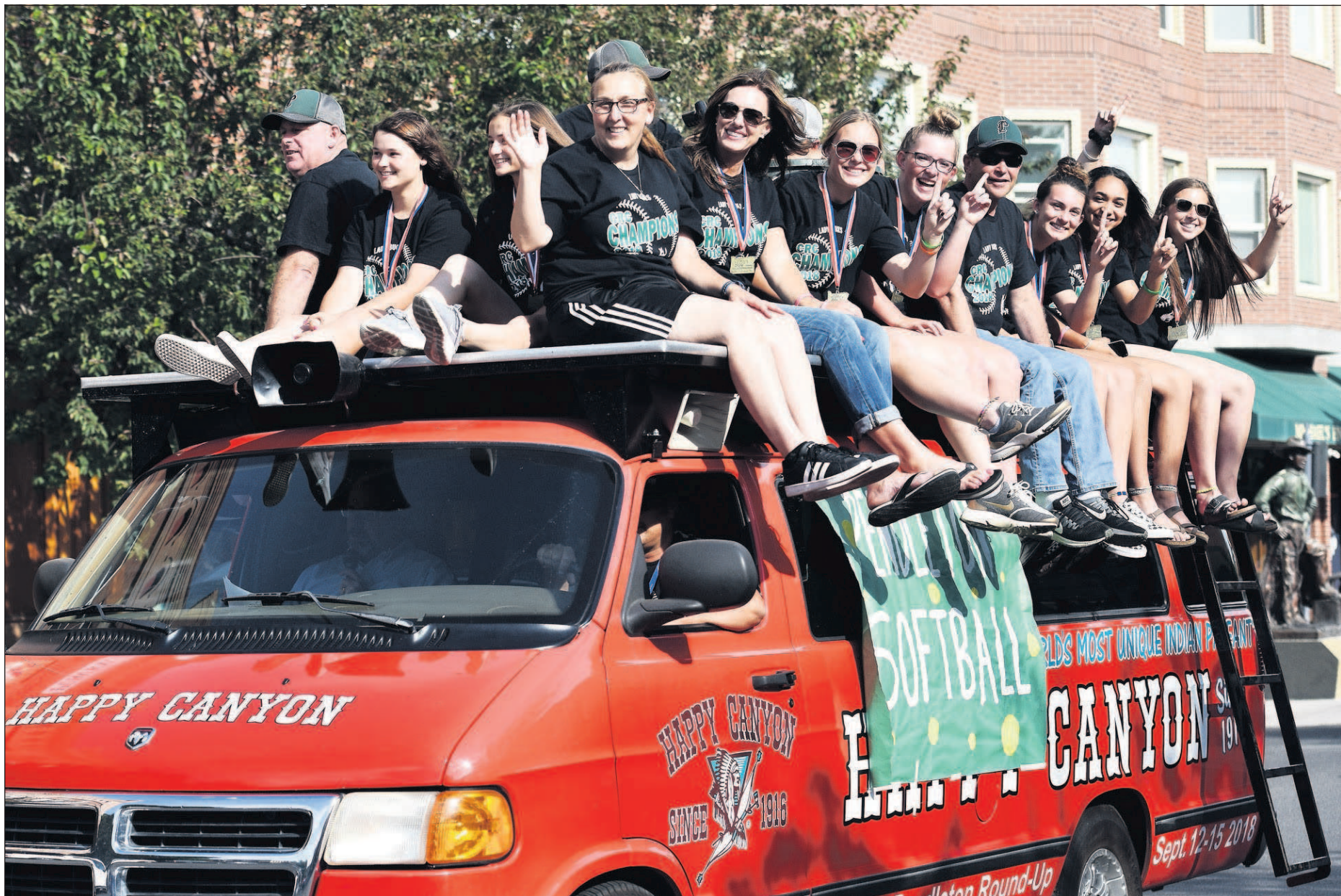
The Pendleton Buckaroos ride on top of the Happy Canyon van down Main Street on Wednesday in Pendleton. The Bucks were celebrating their 7-0 win against Putnam in the 5A state championship softball game last weekend.