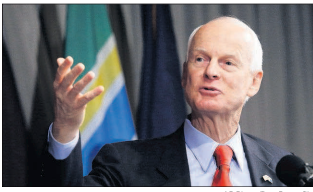
Oregon Secretary of State Dennis Richardson.