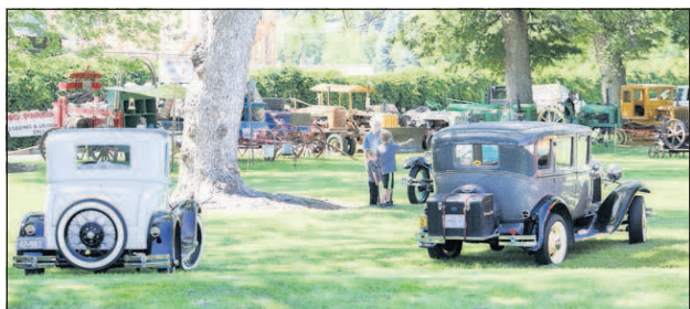
The Old Iron Show at Roy Raley Park runs through Sunday in Pendleton.