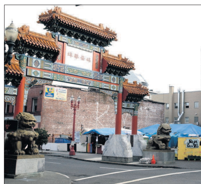
This 2013 file photo shows the entry to Chinatown in Portland. The Portland City Council voted to give developers the option of building taller buildings in the city's New Chinatown-Japantown historic district.