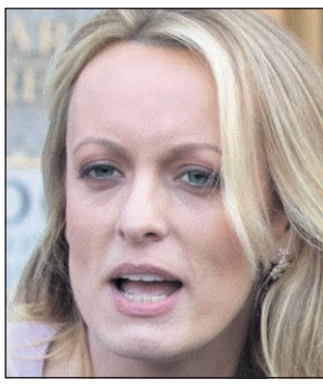
More than 100 people were at the Stars Cabaret on Thursday to see adult film actress Stormy Daniels as part of her Make America Horny Again tour across the country, the Bulletin reported.

BEND (AP) — Adult film actress Stormy Daniels was forced to cut short a performance at an Oregon strip club after a man threw a wallet at her face. More than 100 people were at the Stars Cabaret on Thursday to see Daniels as part of her tour across the country, the Bend Bulletin reported. Daniels, whose real name is Stephanie Clifford, was in the middle of a strip performance to Lenny Kravitz's cover of "American Woman" when an apparently intoxicated man threw the wallet at her. Police arrived at the bar and interviewed the man outside. The man told police that he was "wasted" and he was "extremely sorry" for what he did, the report said. Daniels declined to press charges, police said. Daniels made national headlines after she revealed she was paid $130,000 to keep quiet about claims she had sex with President Donald Trump in 2006. Trump has acknowledged reimbursing his lawyer for the payment to Daniels but denies her allegations. The strip club in Bend, Oregon, promoted Daniels' appearance on Thursday as a chance to see history in person. It charged $20 for admission and an additional $15 to $25 for seats