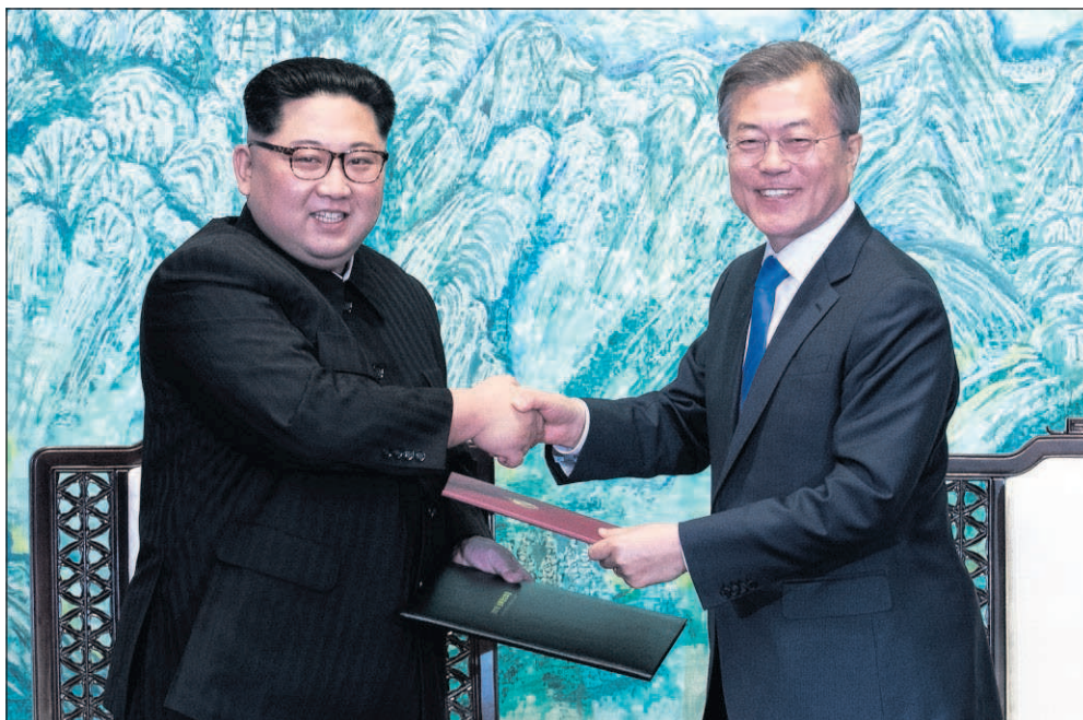
In this April 27 file photo, North Korean leader Kim Jong Un, left, and South Korean President Moon Jae-in shake hands after signing on a joint statement at the border village of Panmunjom in the Demilitarized Zone, South Korea. The two Koreas will hold a high-level meeting on Wednesday to discuss setting up military and Red Cross talks aimed at reducing border tension and restarting reunions between families separated by the Korean War.

It called the two-week Max Thunder drills, which began Monday and reportedly include about 100 aircraft, an "intended military provocation" and an "apparent challenge" to an April summit between Kim and South Korean President Moon Jae-in, when the leaders met on their border in their countries' third-ever summit talks since their formal division in 1948. KCNA said the U.S. aircraft mobilized for the drills include nuclear-capable B-52 bombers and stealth F-22 fighter jets, two of the U.S. mili-