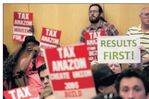
People fill seats before a Seattle City Council meeting where the council was expected to vote on a "head tax" Monday in Seattle.

Despite the North's moves, some experts were skeptical about whether Kim would completely give up a nuclear program that he had pushed so hard to build. Kim has expressed his intention to negotiate over his weapons, but he still uses a long-contentious term, "the denuclearization of the Korean Peninsula." The North previously has used this phrase when demanding that the United States pull its 28,500 troops out of South Korea and withdraw its so-called "nuclear umbrella" security guarantee to South Korea and Japan as a condition for its nuclear disarmament.