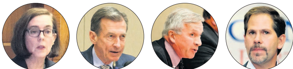
Oregon Gov. Kate Brown (D)