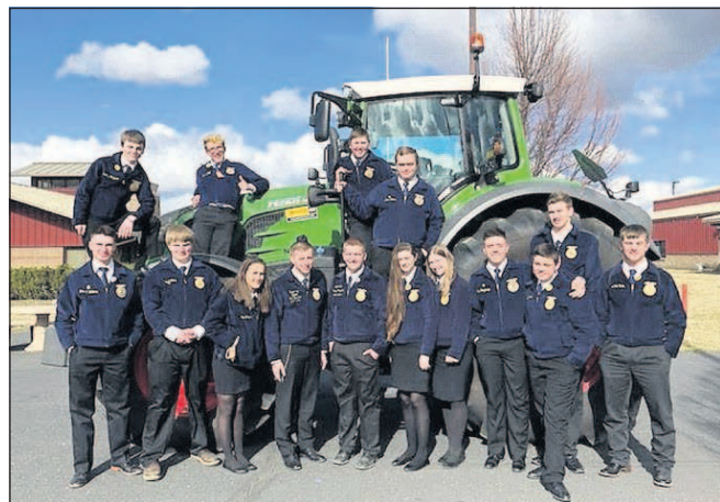
FFA Chapter members pose for a photo with the National FFA vice president while at the Oregon FFA State Convention in Redmond.