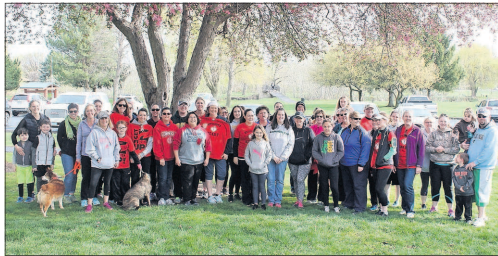
Employees from the Pendleton School District participated in the PSD Wellness Walk April 14 at Community Park.