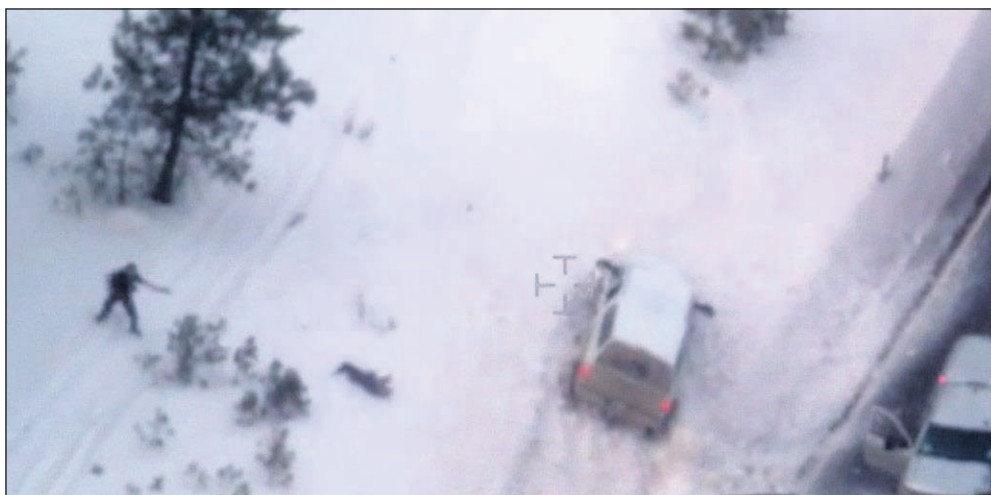
This photo taken from an FBI video shows Robert “LaVoy” Finicum after he was fatally shot by police Jan. 26, 2016 near Burns. On Tuesday, authorities said police were justified in killing Finicum.