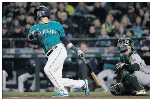
Seattle Mariners' Mitch Haniger watches his three-run home run in front of Oakland Athletics catcher Jonathan Lucroy during the seventh inning Friday's game in Seattle.

Khris Davis hit two home runs for Oakland, a two-run