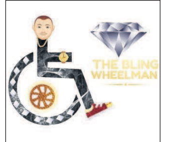
The first The Bling Wheelman T-shirt design.