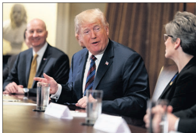
Gov. Pete Ricketts, R-Neb., left, listens as President Donald Trump speaks to Sen. Joni Ernst, R-Iowa, during a meeting with governors and lawmakers in the Cabinet Room of the White House Thursday in Washington.

The president has mused publicly about rejoining the