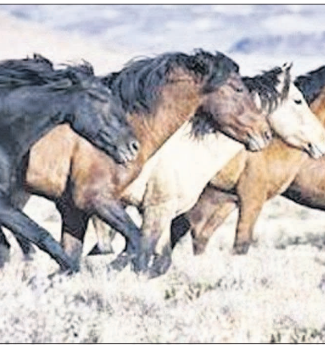
The emergency roundup of 150 wild horses in Oregon after a 2016 fire violated environmental law, a judge has ruled.

Feds approved removal of 150 horses after 2016 fire By MATEUSZ PERKOWSKI EO Media Group A federal judge has ruled the U.S. Bureau of Land Management violated environmental law by rounding up wild horses in Eastern Oregon after a 2016 fire.