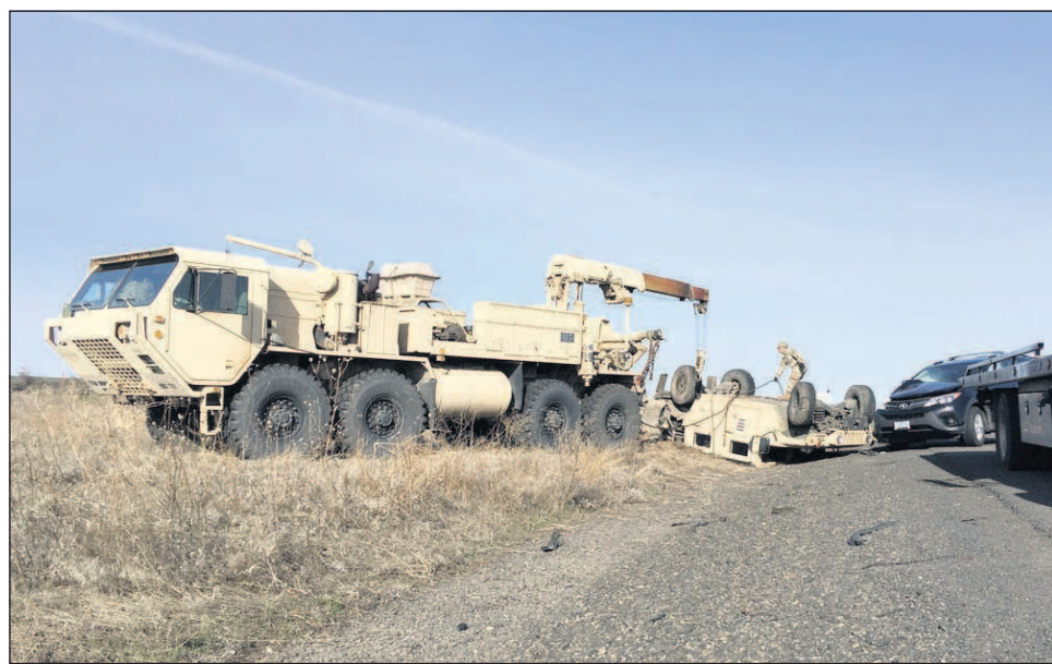
A Humvee is prepared to be flipped back on its wheels after a rollover crash with an SUV Monday morning on Interstate 84 west of Pendleton.

Early diagnosis of Alzheimer's is critical to making informed decisions. If you are concerned about cognitive decline in yourself or a loved one, schedule this short, in-person screening by calling 541-704-7146 for an appointment.