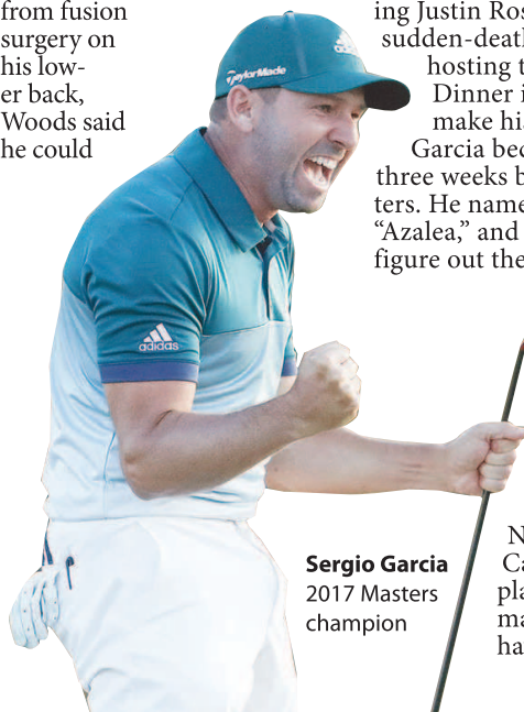
Sergio Garcia 2017 Masters champion

Garcia won his first major in his 70th try as a pro. Next on that list in the 86-man field at Augusta National? Paul Casey, who will be playing in his 56th major without having won one.