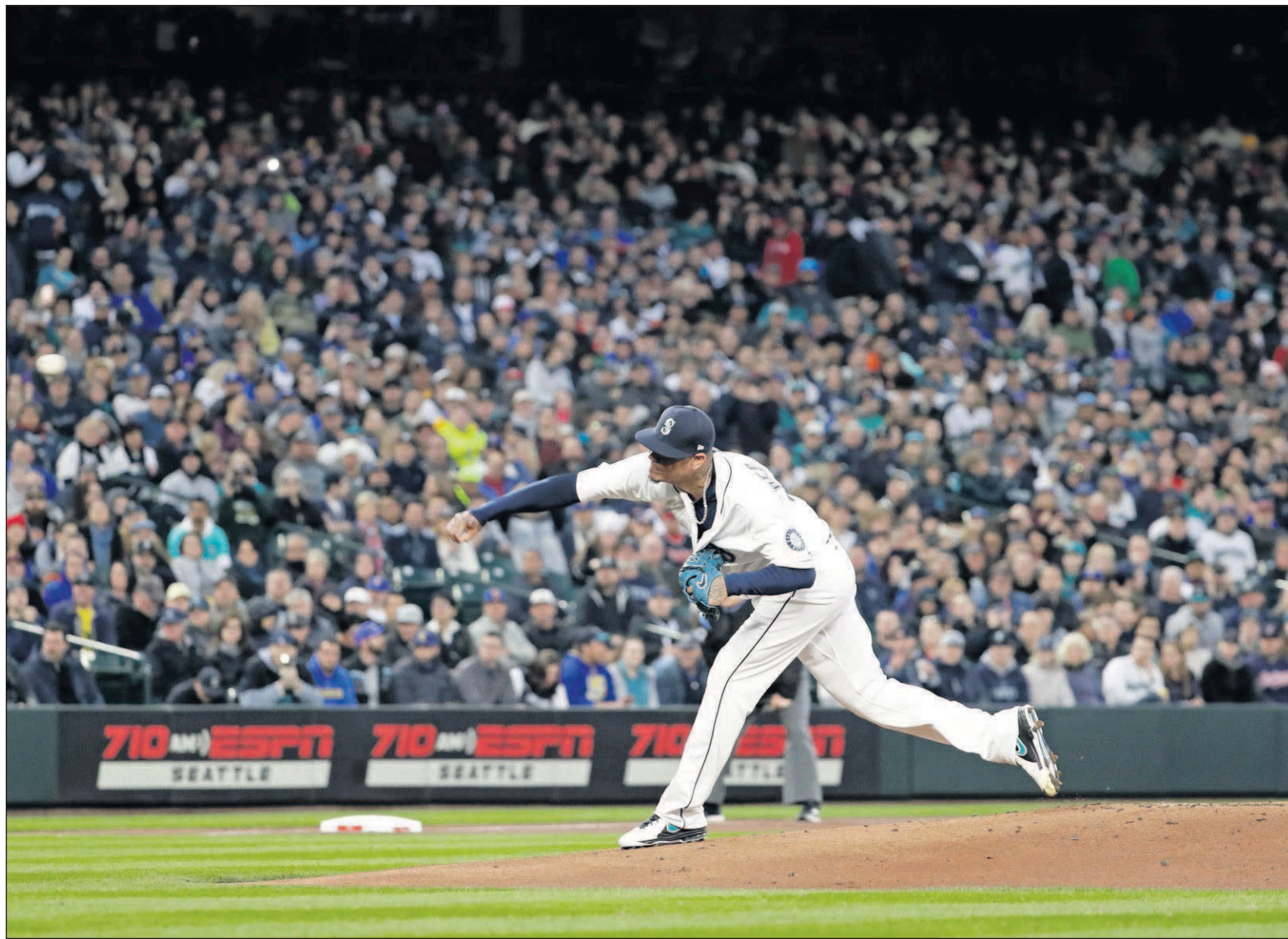
Seattle Mariners starting pitcher Felix Hernandez throws the first pitch to the Cleveland Indians in the first inning of a baseball game Thursday in Seattle.