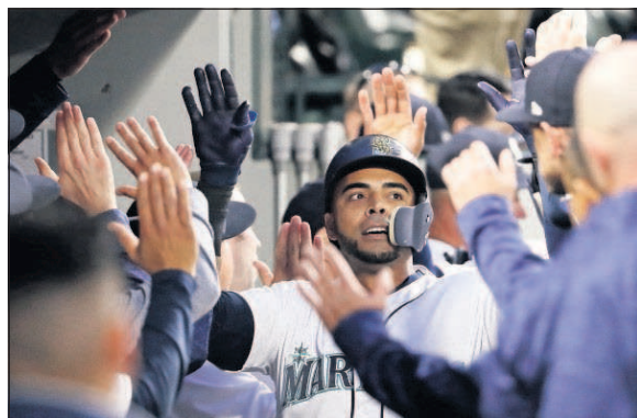
Seattle Mariners' Nelson Cruz is congratulated after his two-run home run against the Cleveland Indians during the first inning of a baseball game Thursday in Seattle.

VIEW A FULL-PAGE GRAPHIC PREVIEWING THE 2018 MLB SEASON PAGE 3B