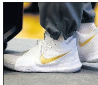
New England Patriots tight end Rob Gronkowski wears Nike sneakers as he speaks to the media after an NFL game against the Miami Dolphins in Foxborough, Mass.

NEW YORK (AP) — Nike reported its first quarterly loss in 20 years, due to a $2 billion tax expense related to recent changes in U.S. tax law. But the sneaker company's third-quarter results easily beat expectations and its shares jumped in after-hours trading.