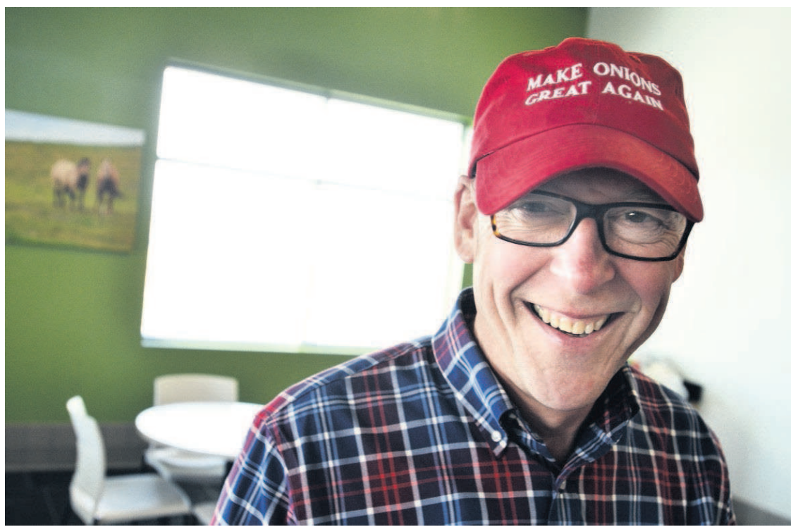
Rep. Greg Walden wears a Make Onions Great Again hat during a visit to the BMCC campus Sept. 29 in Pendleton.