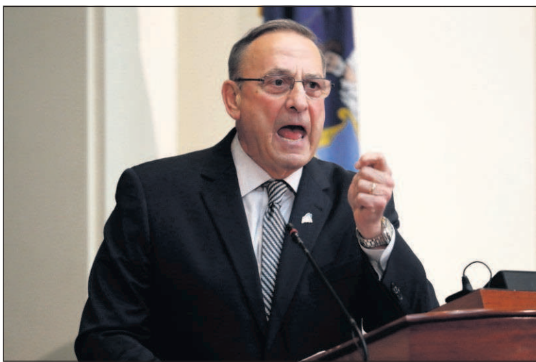
In this Feb. 13 file photo, Gov. Paul LePage delivers the State of the State address to the Legislature at the State House in Augusta, Maine. President Trump's campaign to discredit the news media has spread to state and local officials, who are echoing his use of the term "fake news" as a weapon against unflattering stories and information that can tarnish their images.

The winners of the contest, it turns out, will be announced at the end of Sunshine Week, an annual focus by the nation's news media