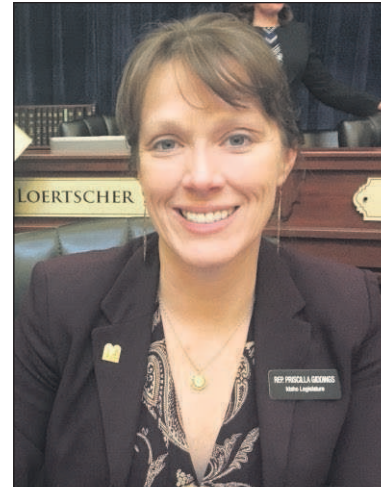
In this March 1 photo, Idaho Republican state Rep. Priscilla Giddings sits at the Capitol in Boise.

Experts on the press and democracy say the cries of "fake news" could do long-term damage by sowing confusion and contempt for journalists and by undermining the media's role as a watchdog on government and politicians. They say it's already exacerbated the