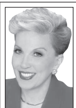
JEANNE PHILLIPS Advice

Dear Furious: Your husband isn't being honest. At the very least there WAS "sex talk" as soon as he used that three-letter word in his emails/texts to the women on the dating sites. You two are overdue for a visit to a marriage and family therapist to determine if the damage your husband has done to