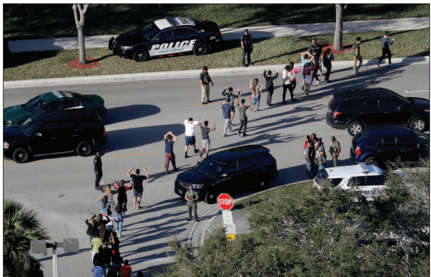
In this Feb. 14 file photo, students hold their hands in the air as they are evacuated by police from Marjory Stoneman Douglas High School in Parkland, Fla., after a shooter opened fire on the campus.