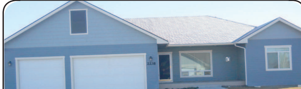
$285,000 BEAUTIFUL 3 bedroom, 2 bath home in Hermiston. Open floor plan, gas fireplace, island kitchen and pantry. Large master with walk-in closet 3 car garage with loft that could be converted for extra space it already has flooring and electrical. RV parking and TUGS. Call JEANNA at 667-2000. RMLS # 18126031