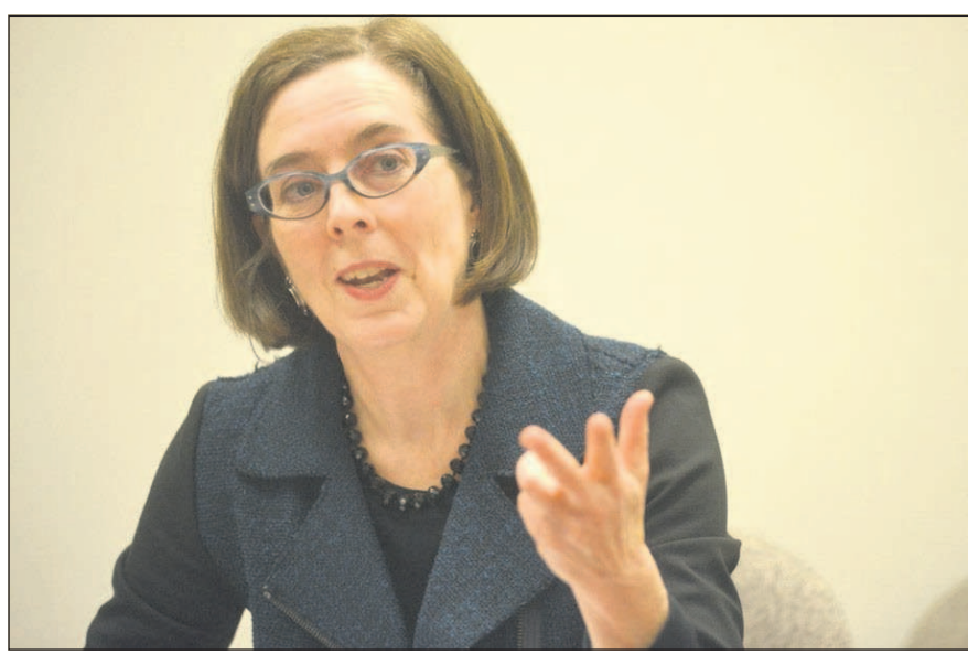
Gov. Kate Brown wants the Legislature to authorize money to hire an additional 185 Child Welfare workers.

to what auditors say is a dire shortage of workers. In order to adequately meet the needs of the thousands of kids in its care, DHS would need to hire about 769 more field staff, auditors said.