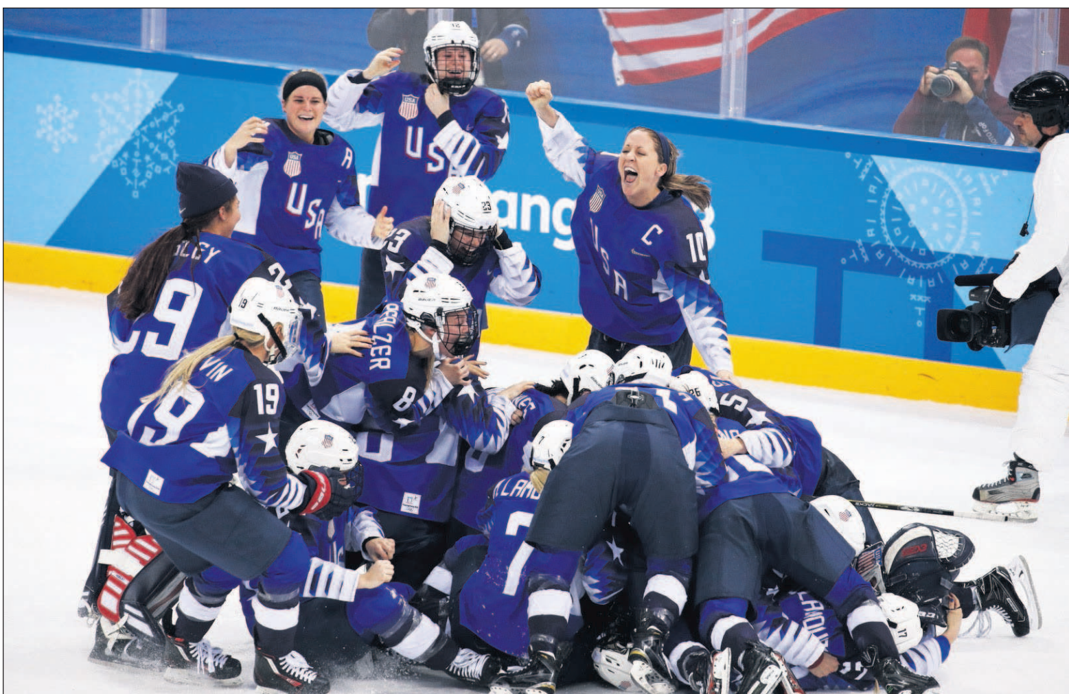
United States celebrates winning the women's gold medal hockey game against Canada at the 2018 Winter Olympics in Gangneung, South Korea, Thursday, Feb. 22, 2018.