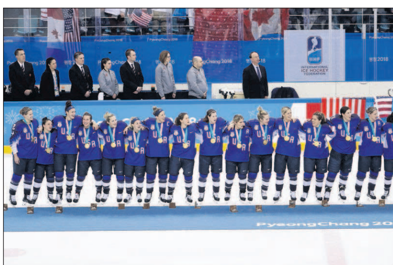
Members of the United States hockey team poses with their gold medals after beating Canada in the women's gold medal hockey game at the 2018 Winter Olympics in Gangneung, South Korea.

Maddie Rooney made 29 saves for the win against their archrival.