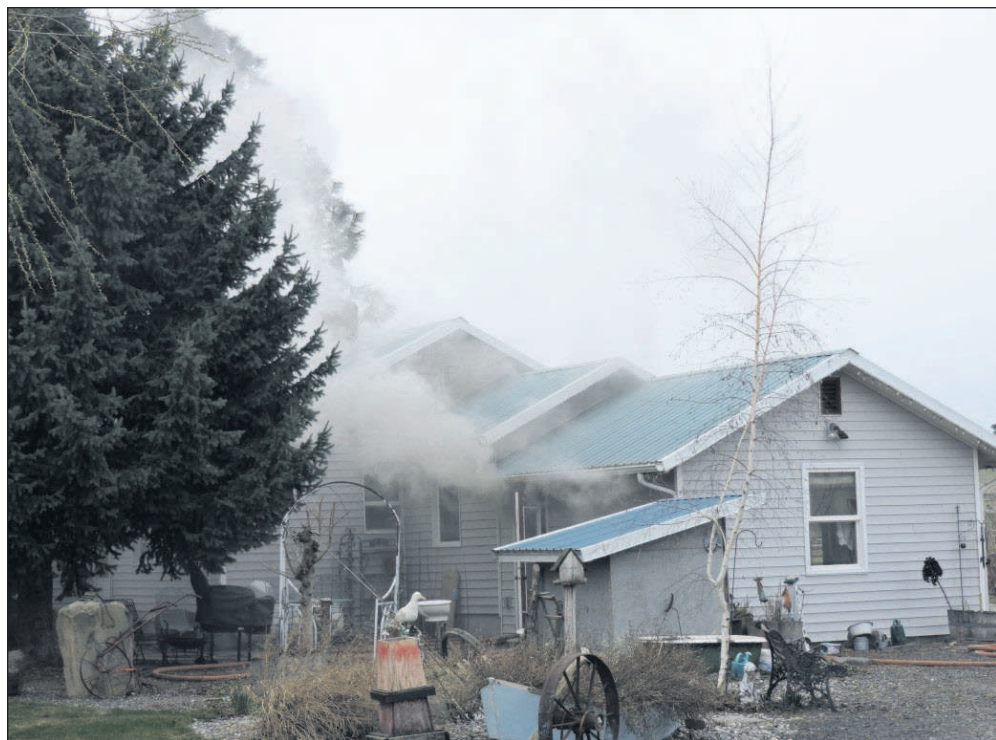
A fire on North Ash Road in Stanfield may have started in the basement, and smoke was coming out of the chimney and eaves on Tuesday afternoon. Officials said no one was injured, and the cause wasn't reported by Tuesday evening.