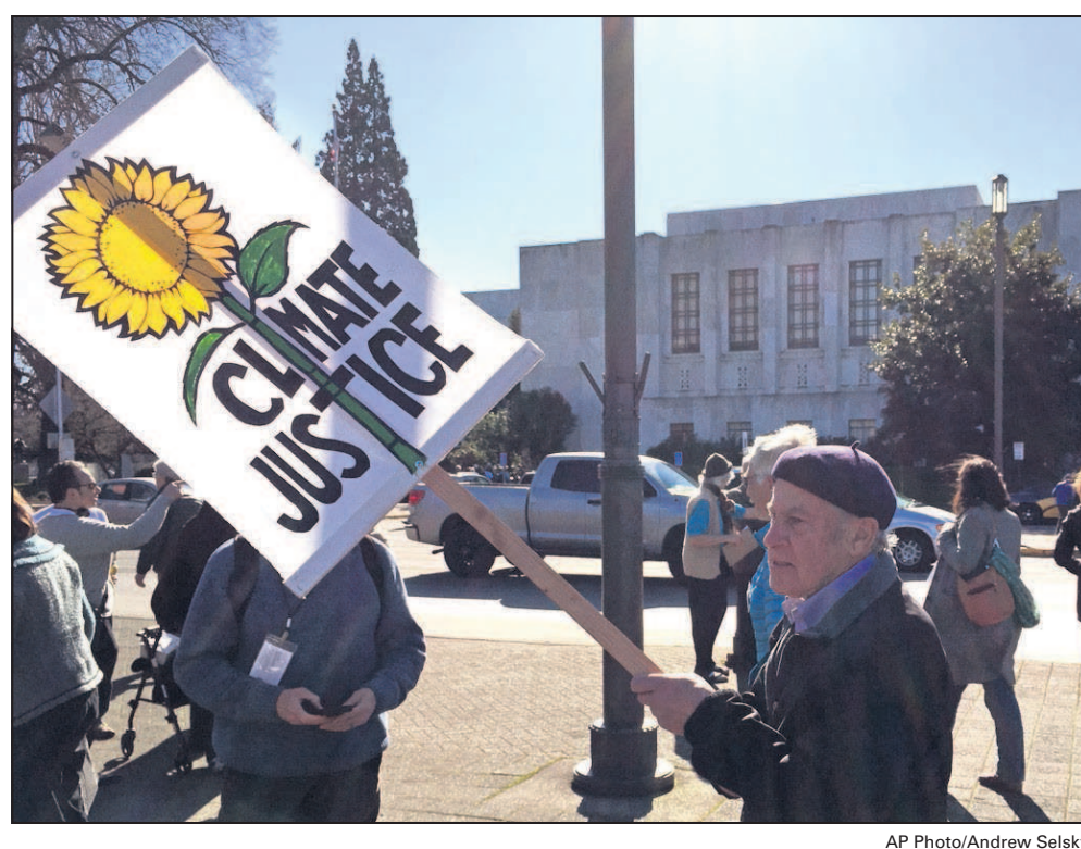
A protester carries a sign in front of the Capitol building in Salem on Monday.

SALEM (AP) — Hundreds of protesters converged on the Oregon Capitol to push lawmakers to adopt legislation that would place a cap on greenhouse gas emissions and impose a fee on companies that exceed maximum levels. Some lawmakers have said the current short session that lasts only 35 days should be just for budget issues and fine-tuning legislation. But two greenhouse-gas bills in the House and Senate, sponsored by 31 lawmakers and weighing in at up to 34 pages apiece, were taking center stage on Monday. Committee hearings were to be held in the afternoon. At midday, protesters gathered outside the Capitol in sunny, chilly weather, carrying signs including ones that said "climate justice." One inflatable sign asked Senate President Peter Courtney to "be a climate hero."