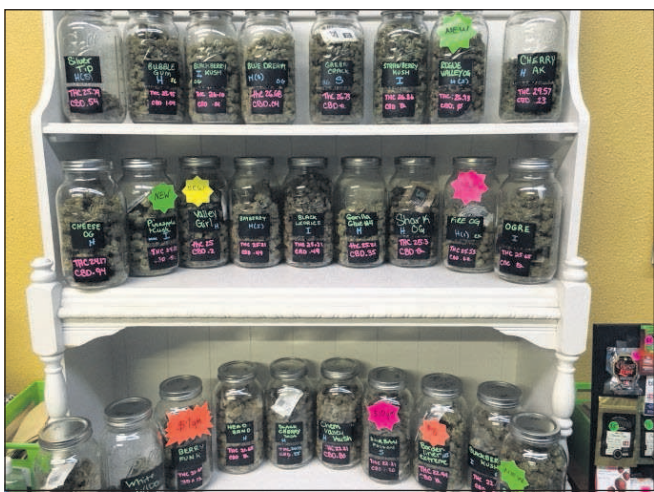
In this Sept. 2016 file photo, different strains of marijuana are displayed in West Salem Cannabis, a marijuana shop in Salem.

Wednesday's audit report comes as there's renewed attention on marijuana,