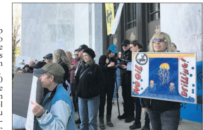
People gather with signs on the Capitol steps in Salem on Tuesday, protesting against a federal proposal that would open up the nation's coastline, including all of Oregon's shores, to oil and gas drilling.

off the coast of the Northwest does not make sense for our communities," Sen. Maria Cantwell, a Democrat from Washington state, said on the Senate floor. She noted that the Pacific Northwest is due for a big earthquake at any time, and urged Interior Secretary Ryan Zinke to drop "this foolish idea."