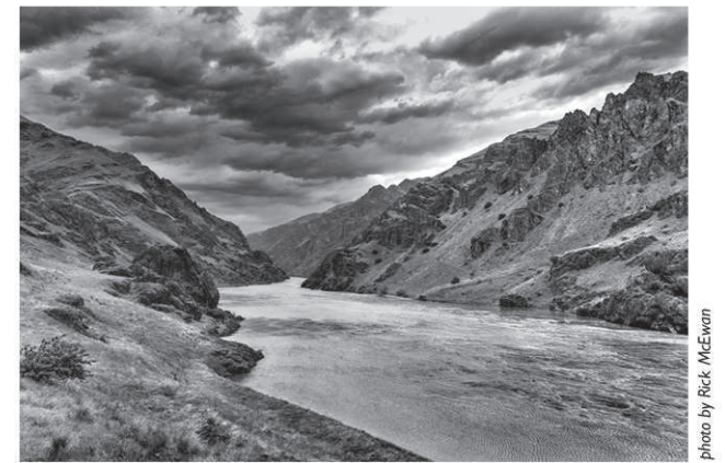
Public Reception Thurs., Feb. 1, 5:30 - 7:00 PM Wilderness & Sublimity: Photography and the Conservation of Hells Canyon at the Pendleton Center for the Arts

Many of the risks could be decreased with certain mitigation measures, but the study outlined four areas where it said the impacts are significant and cannot be avoided. It identified those risks as train accidents, emergency response delays, negative impacts on low-income communities and the possibility that an earthquake would damage the facility's dock and cause an oil spill.