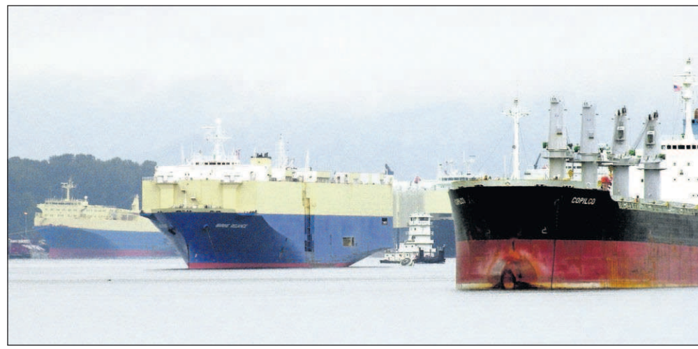
This Oct 2002 file photo shows a tugboat maneuvering through waiting freighters on the Columbia River near the Port of Vancouver in Vancouver, Wash. Jay Inslee on Monday rejected a permit for a massive terminal proposed along the Columbia.

The governor, who is a Democrat, highlighted several issues that led him to his decision, including seismic risks at the site, the potential for an oil spill and the risk that a fire or explosion at the facility would harm workers and the community.