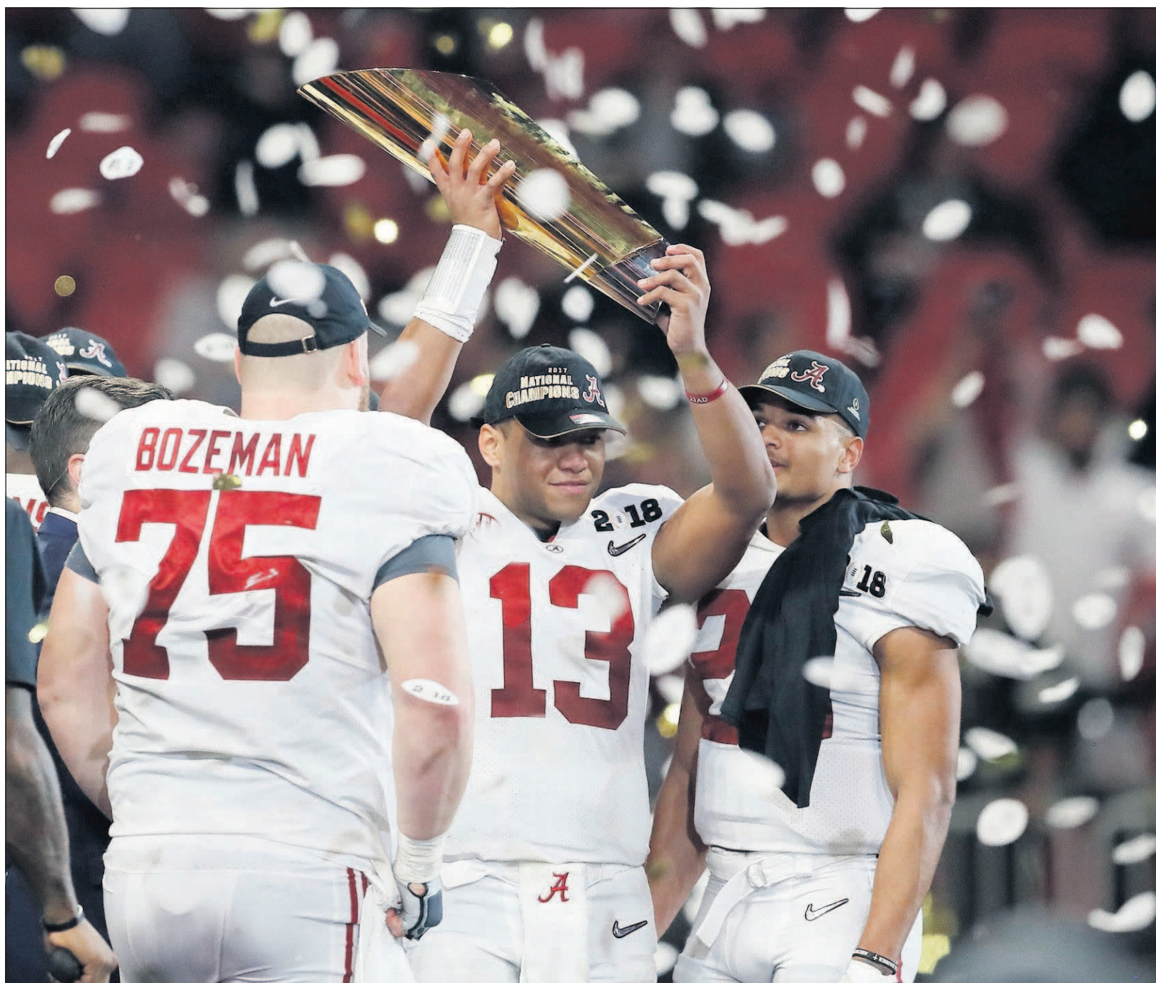
Alabama's freshman quarterback Tua Tagovailoa holds up the championship trophy after Alabama's 26-23 overtime win over Georgia in the college football playoff championship game on Monday in Atlanta.