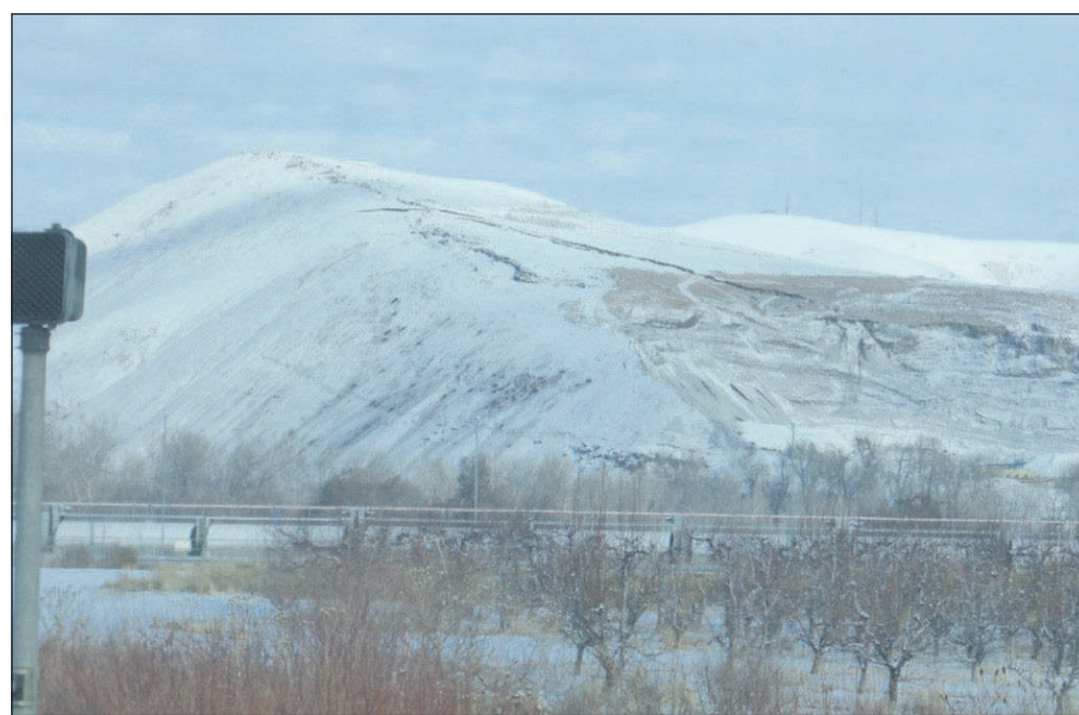
A view of Rattlesnake Ridge from Interstate 82 near the town of Union Gap, Washington. Geologists say fissures in the hillside will likely cause a landslide.

Yakima County Emergency managers believe