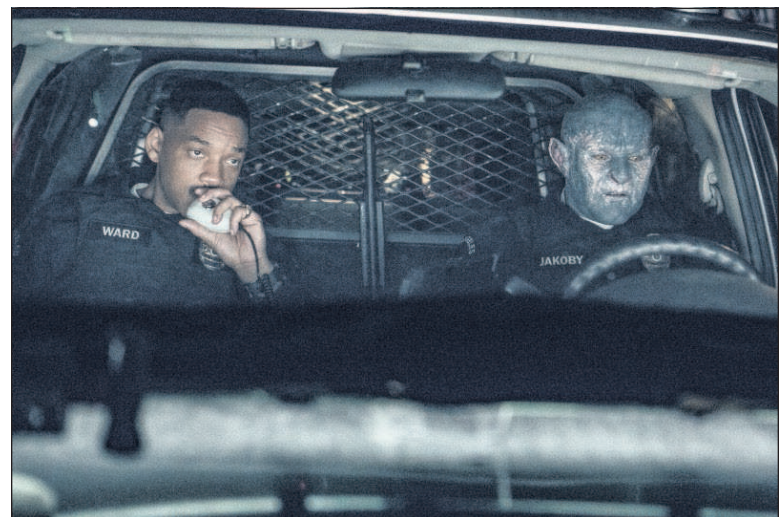
This undated image released by Netflix shows Will Smith, left, and Joel Edgerton in a scene from "Bright."