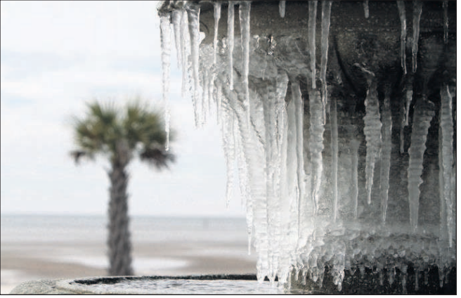
Icicles hang from the fountain at Beau View condominiums in Biloxi, Miss., on Monday. A hard freeze hit South Mississippi overnight and temperatures are expected to remain near or below freezing for the rest of the week.

It was colder in Des Moines, where city officials closed a downtown outdoor ice skating plaza and said it wouldn't reopen until the city emerged from sub-zero temperatures.