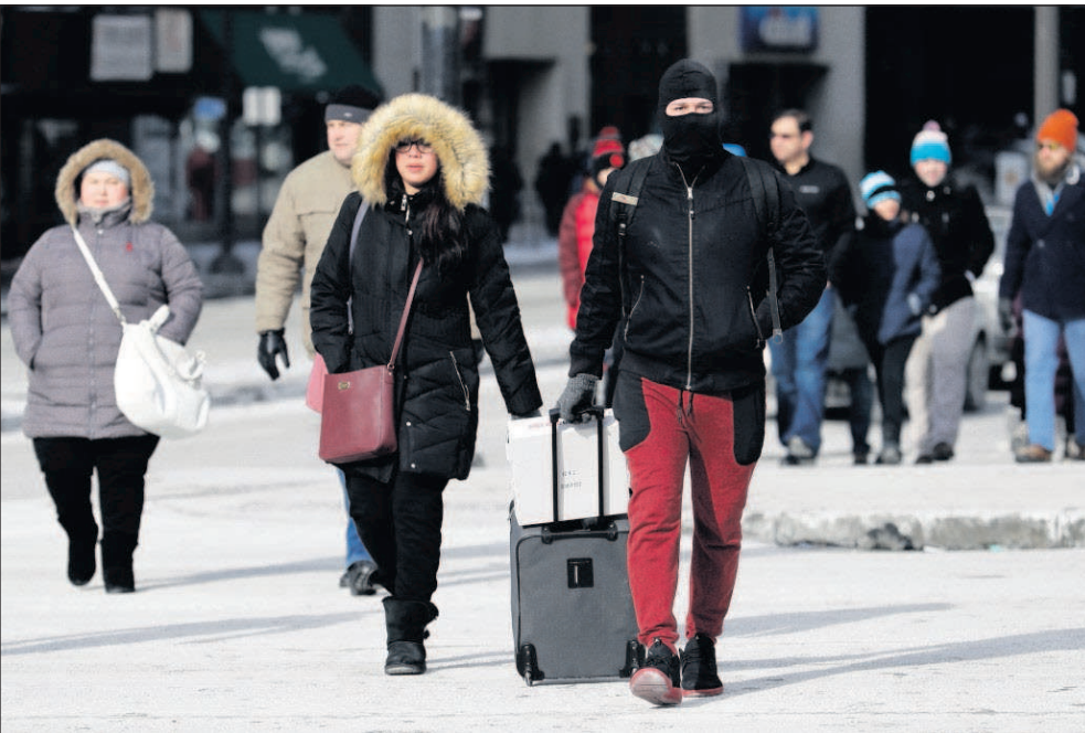
Pedestrians are bundled up against frigid temperatures Sunday in Chicago.

MILWAUKEE (AP) — Bone-chilling cold gripped much of the central U.S. as 2018 began Monday, breaking century-old records, icing over some New Year's celebrations and leading to at least two deaths attributed to exposure to the elements.