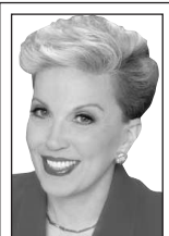
JEANNE PHILLIPS Advice

Dear Abby: My partner of 11 years has decided he is no longer in love with me. He says it's because he thinks I cheated on him. I have told him repeatedly that it didn't happen, which is the truth.