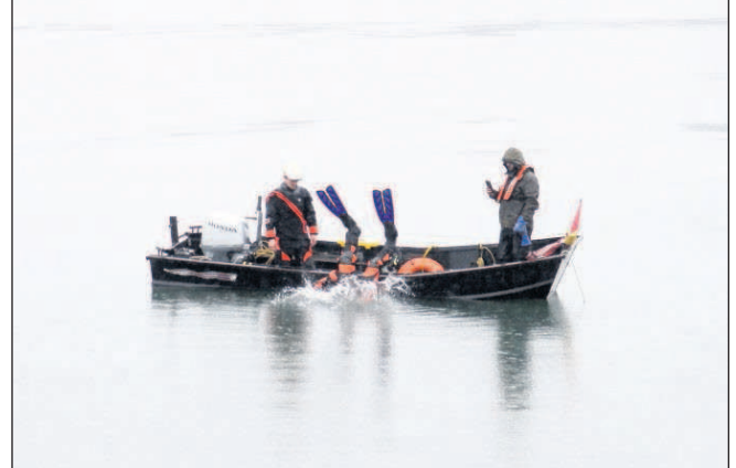
A diver enters the waters Thursday morning off Tongue Point to search for a pickup driven into the river.

ASTORIA — A man fleeing police had to be rescued Wednesday after driving his pickup off a pier and into a side channel of the Columbia River.