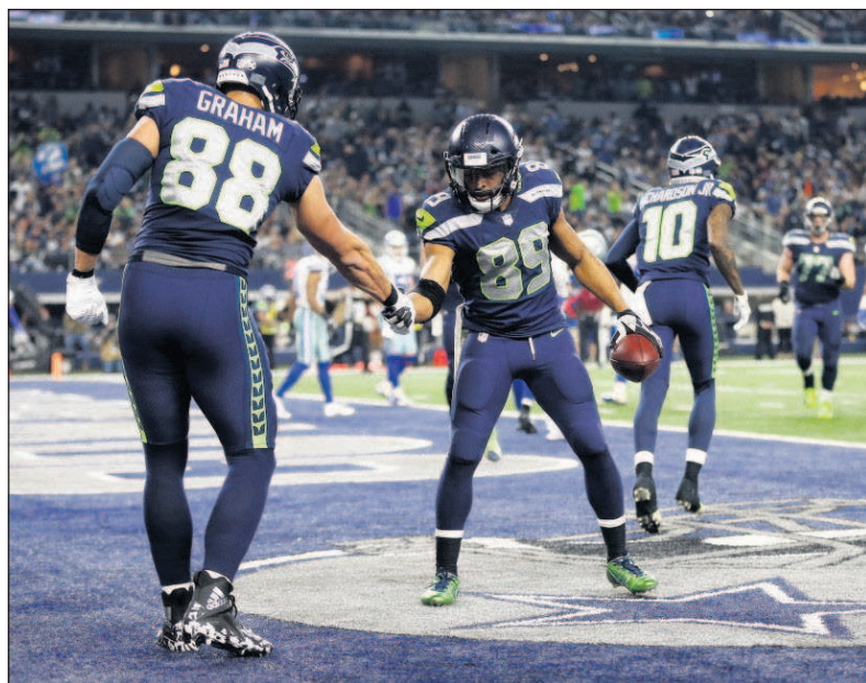
Seattle Seahawks' Jimmy Graham (88) congratulates Doug Baldwin (89) on his touchdown catch in the second half of an NFL football game against the Dallas Cowboys on Sunday in Arlington, Texas.