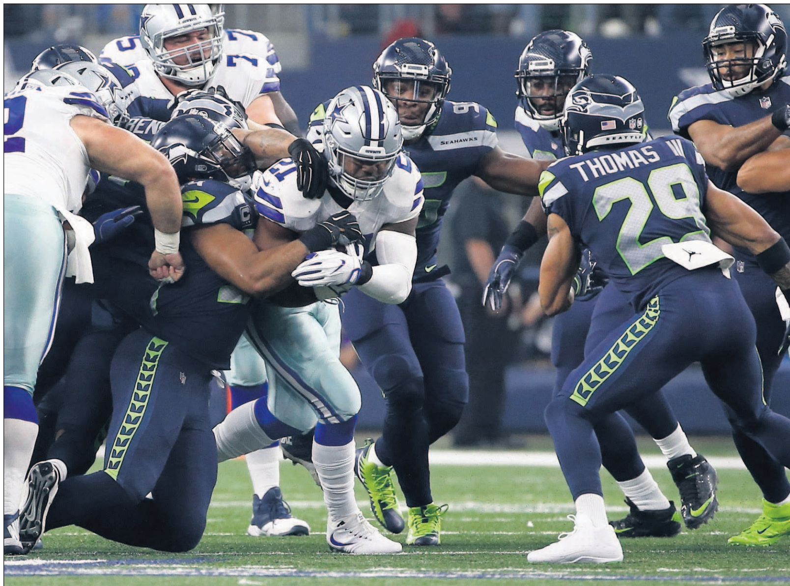
Seattle Seahawks linebacker Bobby Wagner, left, and safety Earl Thomas (29) stop Dallas Cowboys running back Ezekiel Elliott (21) center from advancing the ball in the first half of Sunday's game in Arlington, Texas.