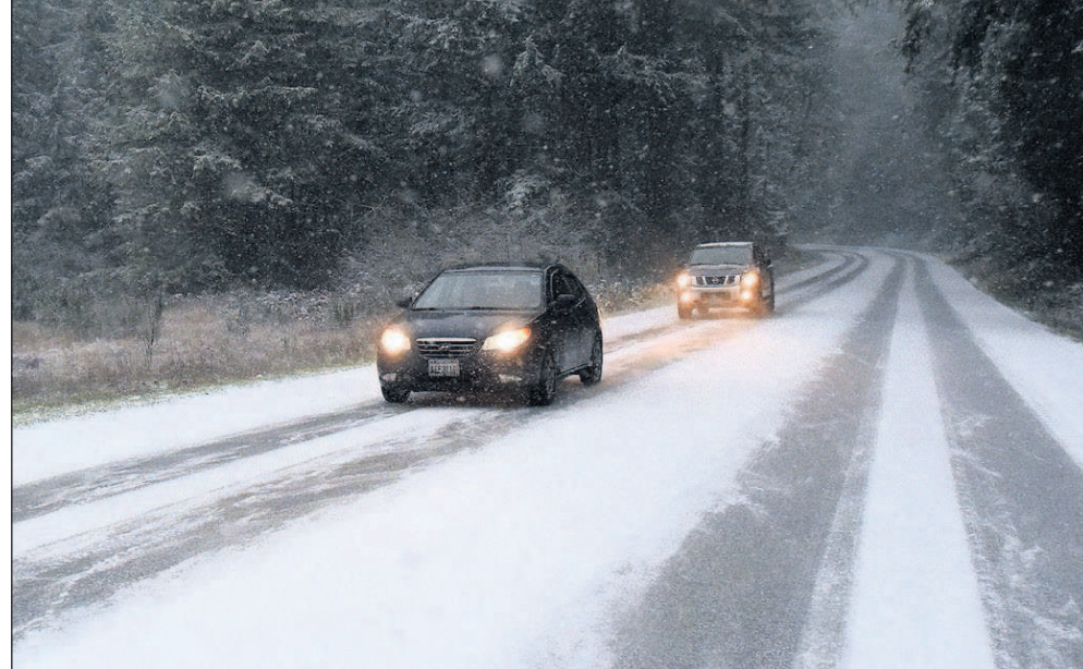
Motorists drive near Yelm, Wash., Sunday. Snow, sleet and freezing rain is making holiday travel challenging in Washington state, Oregon and Idaho.

PORTLAND (AP) — It's a good thing Santa travels by air. Much of the rainy Pacific Northwest got a rare white Christmas that left roadways treacherous.