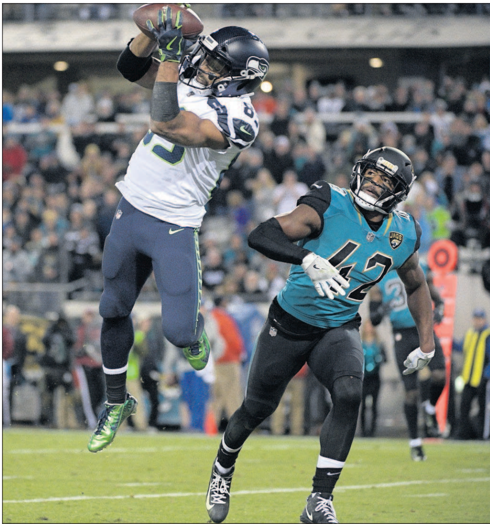
In this Dec. 10, 2017, file photo, Seattle Seahawks wide receiver Doug Baldwin (89) catches a pass in the end zone for a touchdown in front of Jacksonville Jaguars

Seattle (8-6) is coming off the most lopsided loss in eight seasons under Pete Carroll, a 42-7 defeat to the Rams that put Los Angeles on the brink