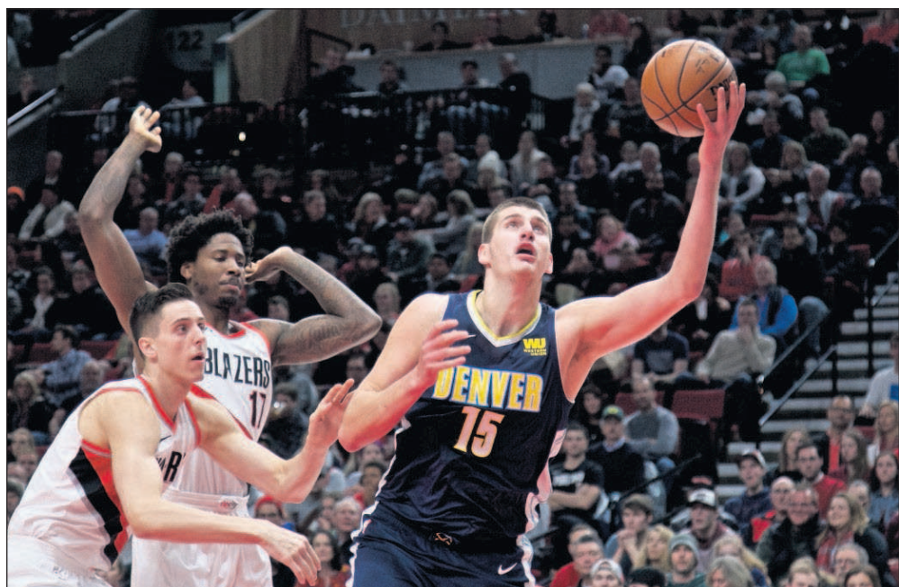
Denver Nuggets center Nikola Jokic, right, shoots past Portland Trail Blazers center Zach Collins, left, and forward Ed Davis, center, during Friday's game in Portland.