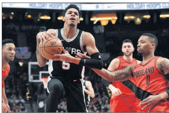
San Antonio Spurs guard Dejounte Murray drives to the basket past Portland Trail Blazers guard Damian Lillard during the first half of Wednesday's game in Portland.