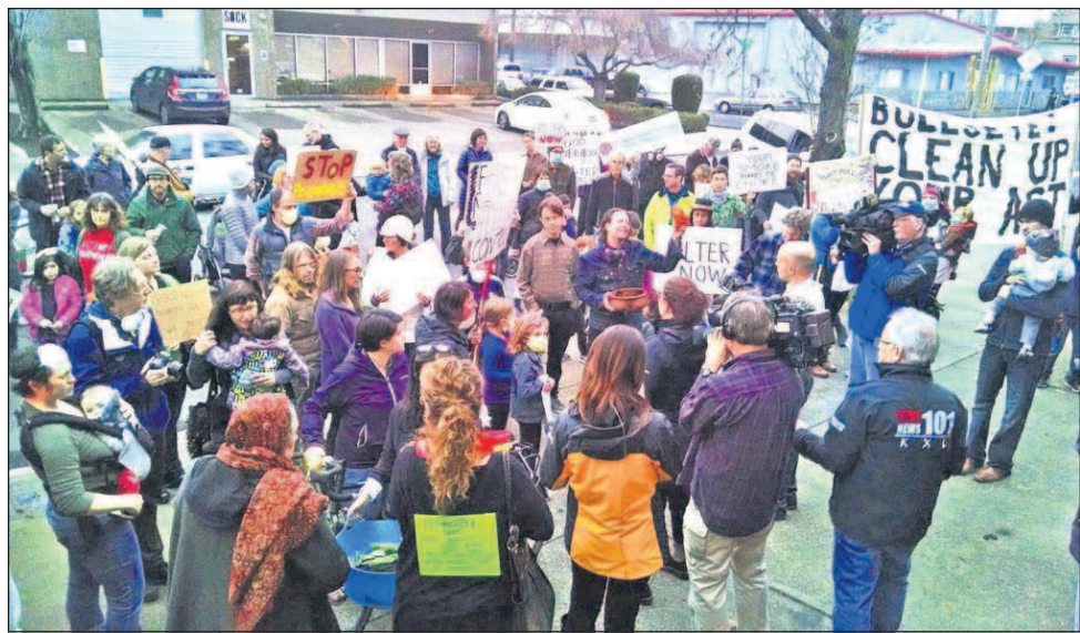
Protesters demonstrate outside of Bullseye Glass Co. in Southeast Portland in 2016, calling for the Oregon Department of Environmental Quality to shut down the company's operations during an air pollution investigation.

The owners of Bullseye Glass Co. have sued Gov. Kate Brown and state regulators for $30 million for unfairly targeting the company for elevated levels of air toxins detected in 2015 near the company's Southeast Portland stained-glass factory. The 80-page civil rights complaint filed Tuesday in U.S. District Court claims that the governor and state regulators arbitrarily used Bullseye as a scapegoat for air pollution that came from multiple sources and for the state's lax enforcement of air quality regulations. State regulators "used Bullseye as a scapegoat to conceal from the public (the Department of Environmental Quality's) failure to establish any program to identify or control toxic waste emissions from small and medium-sized businesses," the lawsuit says. The state's actions damaged "the goodwill, good name and brand that Bullseye's owners had spent a lifetime building," according to the filing. A spokesperson in Gov. Brown's office was not immediately available Tuesday morning to respond to the allegations, but the governor typically does not comment on pending litigation.