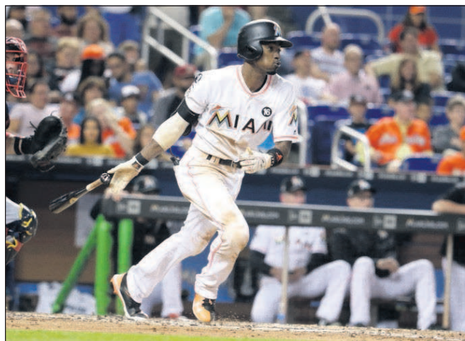
Dee Gordon has been traded from the Miami Marlins to the Seattle Mariners for three prospects in a deal that marks the start of the Marlins' latest payroll purge, this time under new CEO Derek Jeter.