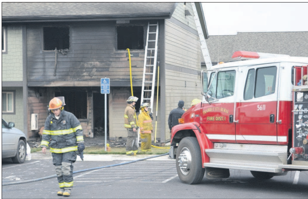
Two members of a family staying at the Strawberry Village apartment complex in Prairie City died in a fire Thursday.

pounding on the walls of her apartment about 2:40 a.m. while she lay in bed but didn't consider it unusual. Then she heard a very loud bang.