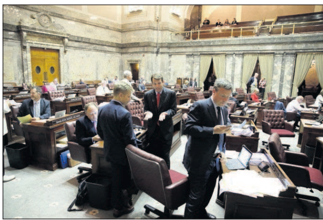
In this June 30 photo, the public gallery is visible above the Senate floor at upper right in the Capitol in Olympia, Wash.