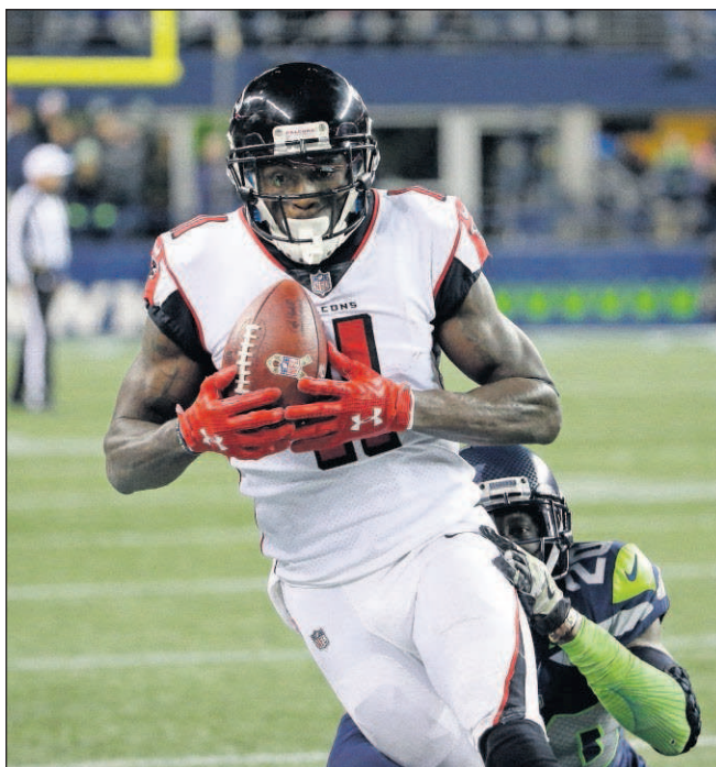
Atlanta Falcons' Julio Jones pulls down a pass in front of Seattle Seahawks' Jeremy Lane in the second half of Monday's game in Seattle.